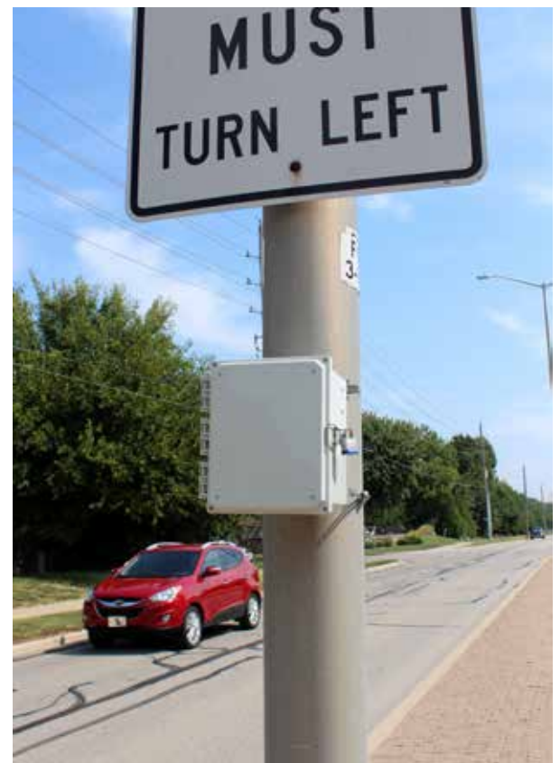
StealthStat - Data Sheet - USA Eng - Print - 09/2019